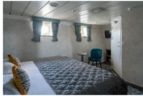
Superior Double Cabin Deck 4 Double Beds Porthole