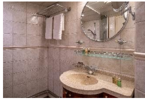
Standard Twin Cabin Deck 3 Twin Beds Porthole