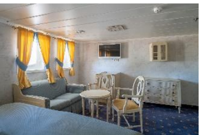
Junior Suite Deck 6 Double Bed Large Windows