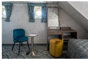
Superior Twin Cabin Deck 3 & 4 Twin Beds Porthole