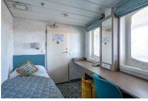
Standard Single Cabin Deck 3, 4 & 5, Single Bed, Windows or Porthole