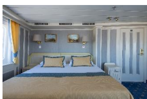
Owner's Suite with private walkway Deck 6 Double Bed Large Windows & Private Walkway