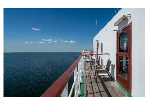
Executive Suite with Balcony Deck 7 Double Bed Private Balcony