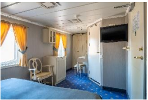
Deluxe Double Cabin Deck 4, 5 & 6 Double Bed Large Window