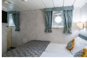
Standard Double Cabin Deck 3 Double Bed Porthole